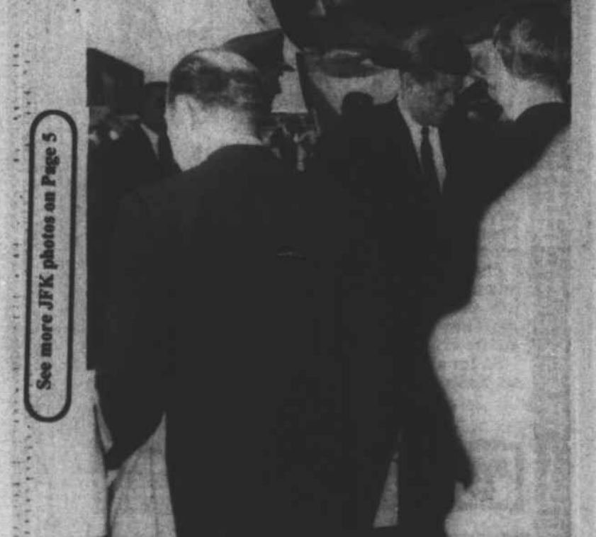
President John F. Kennedy in shown in the center of Secret Service men with the members of the United States Air Force shown in the background.