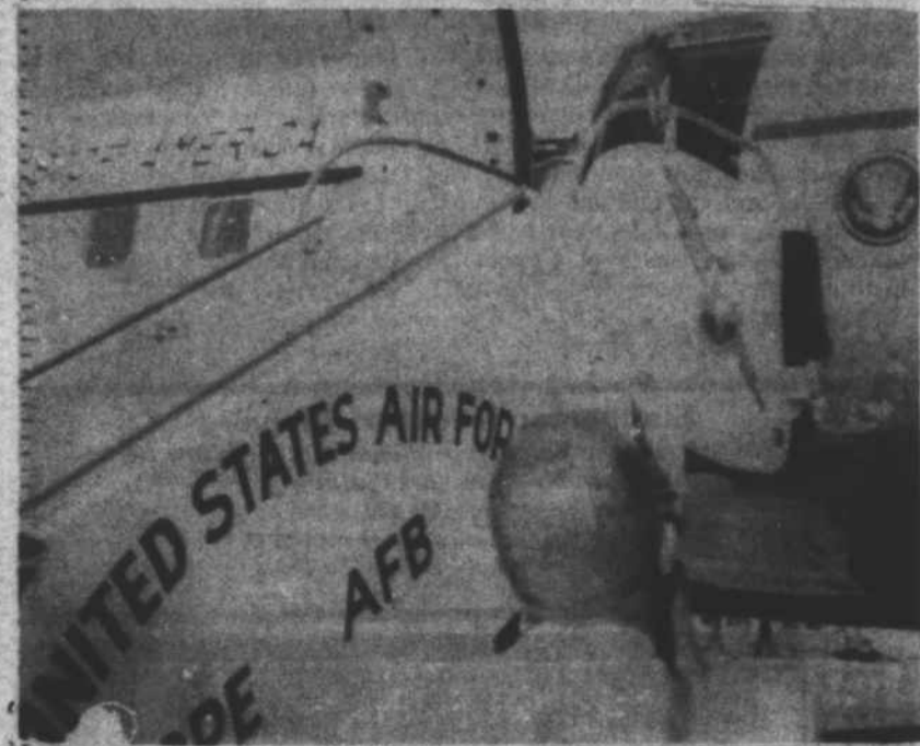
President Kennedy is shown as he arrives at Pope Air Force Base, October 12, 1961.