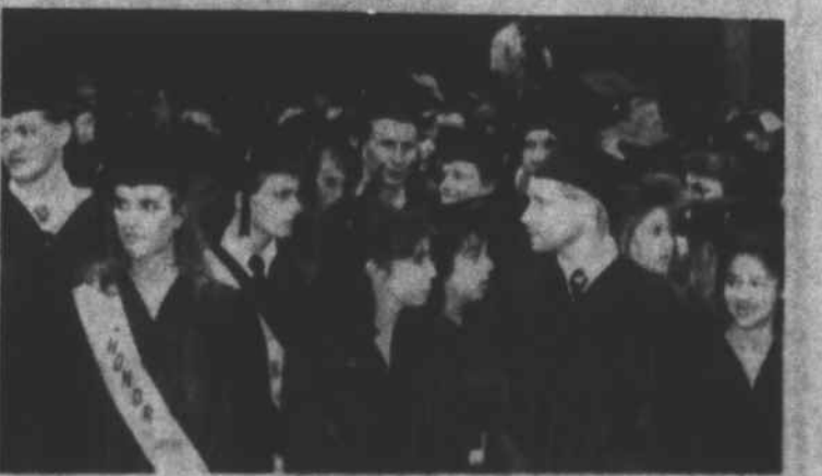
A view of the record graduation class of 531 at Pembroke State University 1st Saturday.