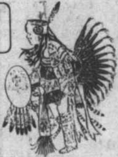
Drums, dancers, singers, storytellers, craftpeople, artists, elders, middle-age and the young people are more welcome and much needed.

ALL food and clothes gathered will be donated to The Robeson County Church and Community Center.