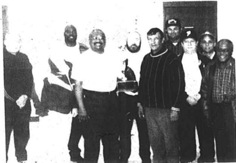
The Purnell Swett High Booster Club sponsored an appreciation dinner Saturday, January 28 for coaches and supporters of the school's distinct athletics.