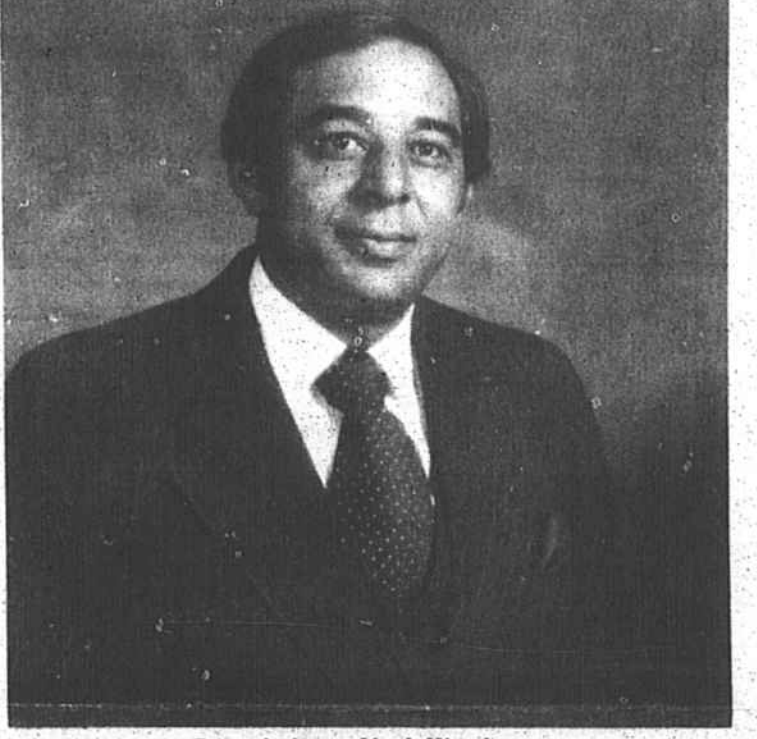
Commissioner Noah Woods