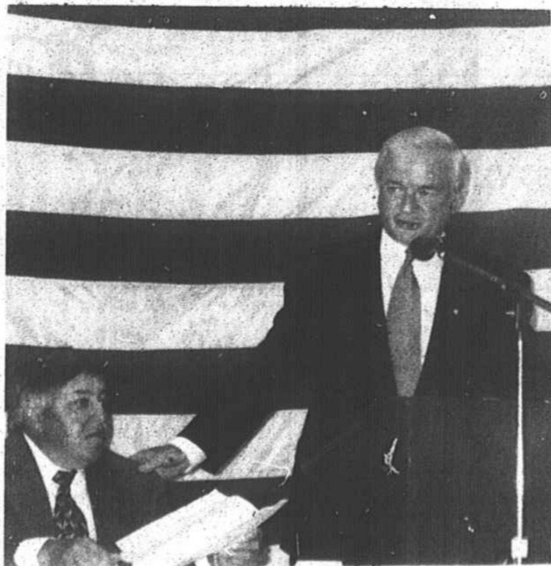
Governor Jim Hunt tells the crowd how much he admires and respects Pembroke Mayor Milton Hunt who is also Chairman of the Robeson County Democratic Party.