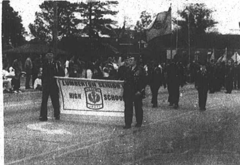
Lumberton ROTC passes in review.