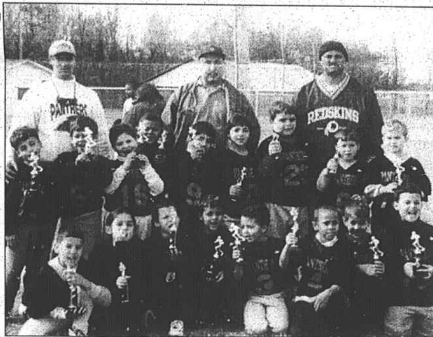
Pembroke Flag Football 1st and 2nd Grade