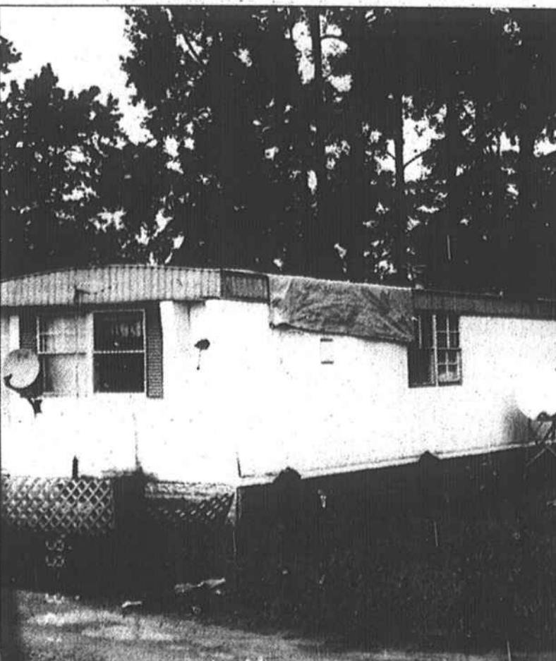
This mobile home and house suffered major damage from Hurricane Floyd. Both are located on the Pine Log Road.