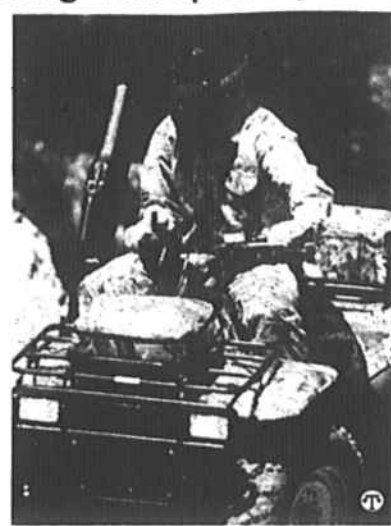
Automatic transmissions are becoming a popular feature on ATVs of all sizes.

• A semi-independent rear suspension (400cc and larger ATVs). A semi-independent suspension allows both rear wheels to