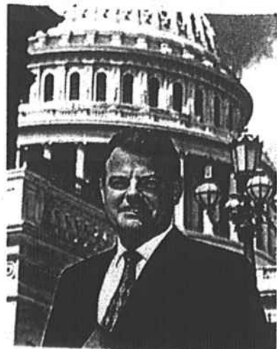
Lumberton--Seventh District Congressman Mike McIntyre filed recently for re-election to the U.S. House of Representatives. McIntyre, who was elected in 1996 and again in 1998, traveled to the State Board of Elections in Raleigh for the official filing.

Congressman McIntyre stated, "Serving the citizens of the Seventh Congressional District has been a high and distinct honor. We are at a crossroads for our future as we enter a new century. We must meet the challenges