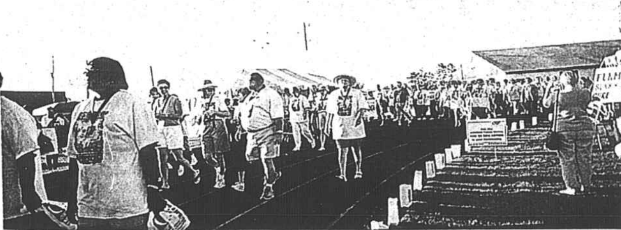
Cancer survivors, relatives, friends and supporters are seen walking around the track at Lumberton High School during the Relay for Life Fund-raiser for the Cancer Society.