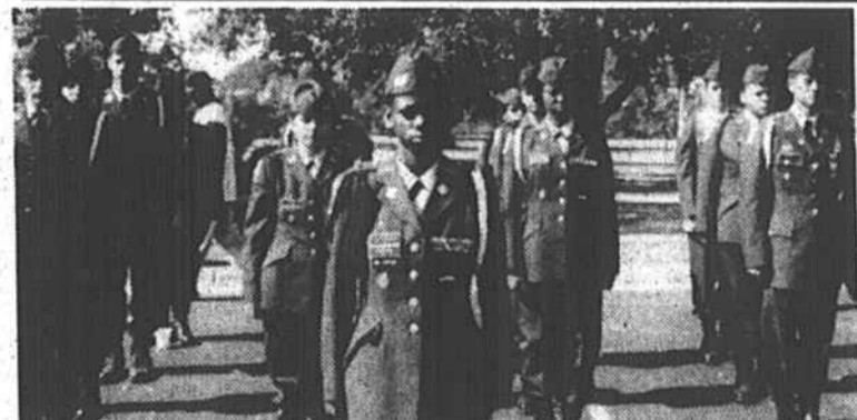
Purnell Swett High School's Army ROTC proudly extends its services in participating in the Veteran's Day and Christmas parades, assisting special Olympics, the arts festival, football and basketball games, graduation or any other situations in which they are needed

The Robeson County Chapter of the American Red Cross is planning a Valentine's Dance for Friday, February 9 from 8 p.m. until 12 midnight. Refreshments will be served. Bring your sweetheart and enjoy this fund raising event. Tickets are $15.00 per couple or $10 per person. The event will be held at the Southeastern Agricultural Center Farmer's Market, I-74, Lumberton, NC. For further information call 910-521-3640.