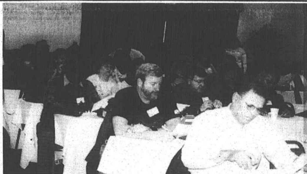
Purnell Swett High School Faculty and staff attend a staff development workshop January 12-14 at Sea Trails Conference Center at Sunset Beach.