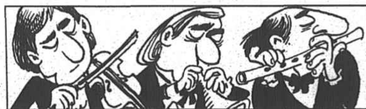
The first orchestra in America was founded in Boston in 1810.

NOTHING BETTER! If we who have made the choice to follow Christ (instead of the CROWD) would hang in there for 24 hours a day, seven days a week, we would KNOW, without any doubt, that there is NOTHING BETTER out there (in fact NOTHING THAT CAN COMPARE) anywhere on this vast planet, or in the vaster universe beyond!!!