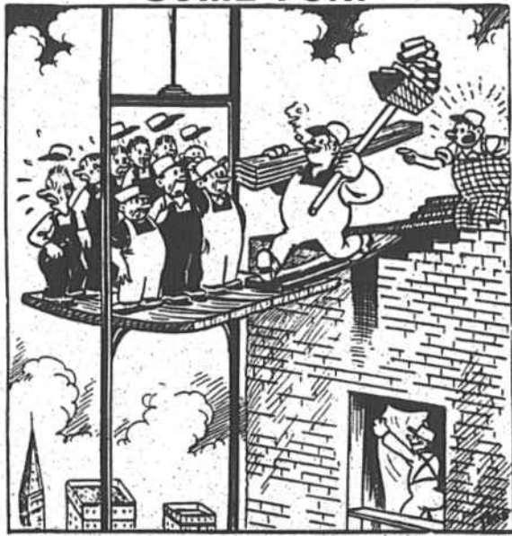
"STEP BACK, FELLERS!"

Lace as we know it developed in Italy in the 1400s. It grew out of cutwork or open pattern in embroidery.