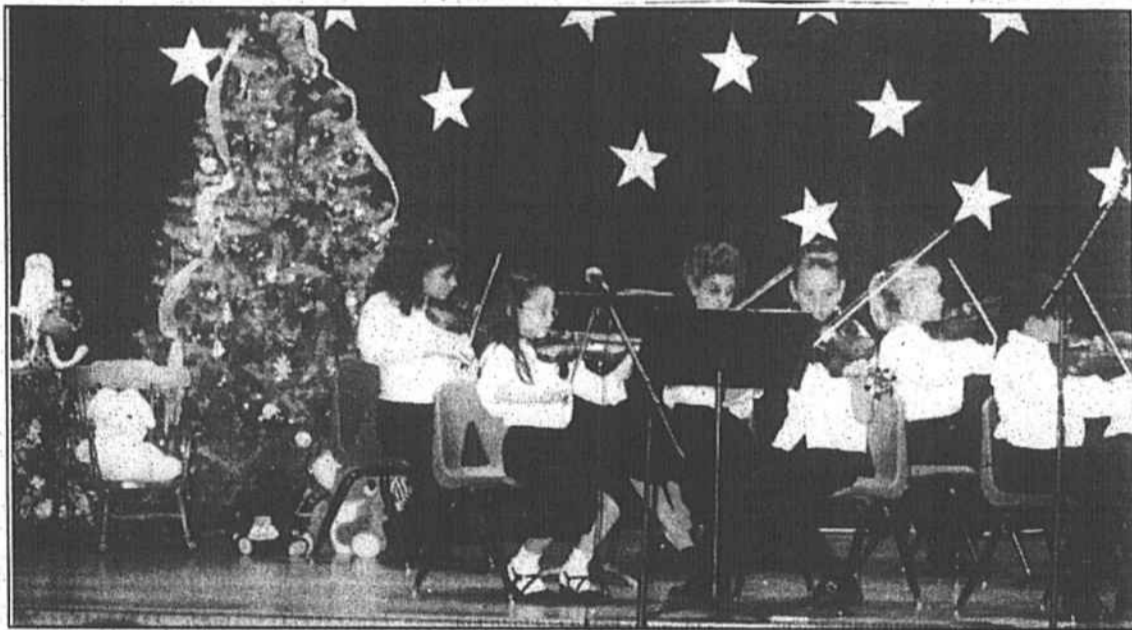
Violinists from the school perform a beautiful piece.