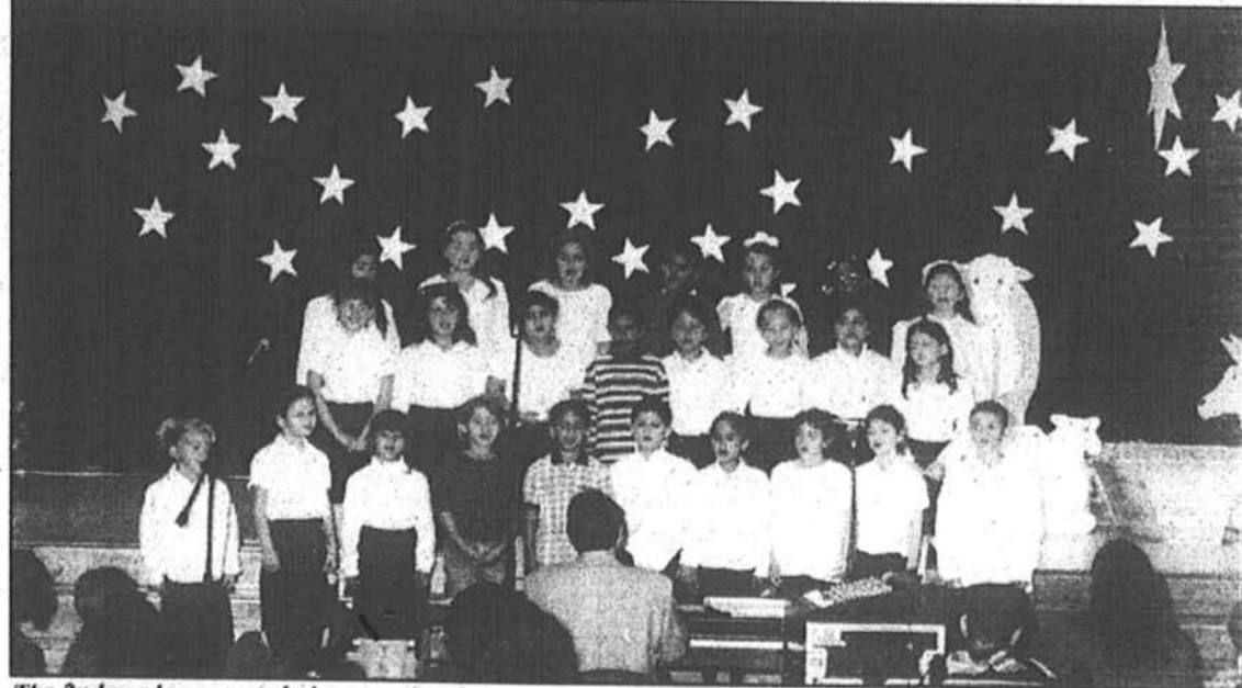
The 2nd grade concert choir entertains the crowd with a song during Monday morning's second show.