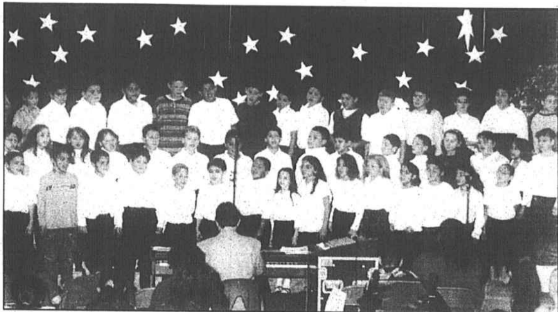
Members of the 3rd, 4th, & 5th grade concert choir sing during one of two performances Monday morning at the school.