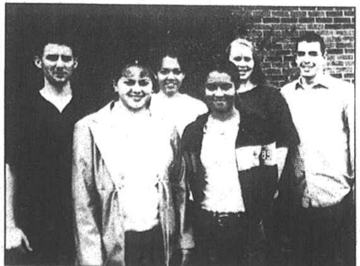
Purnell Swett High School's Literary Society enjoyed an evening with author, Nicholas Sparks at the Cape Fear Regional Theater. Some of his works include-"Message in a Bottle" and "A Walk to Remember."