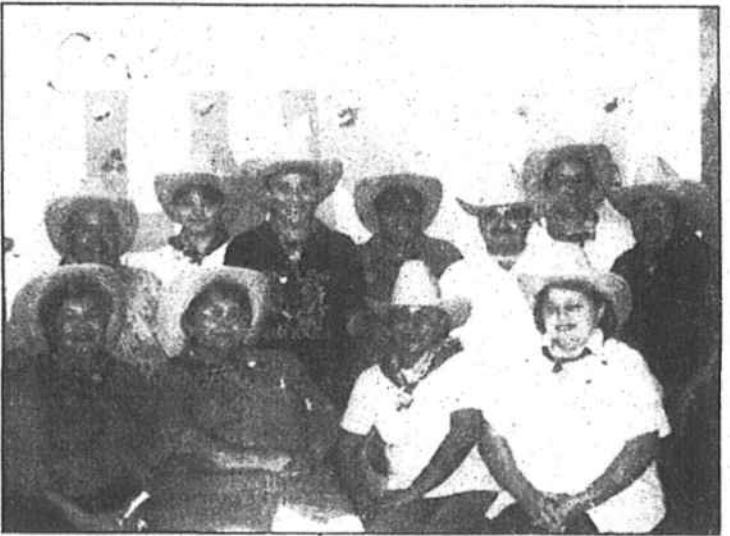
Purnell Swett High School expressed their gratitude to the cafeteria staff for their hard work.

For more information, call SRMC Community Health Services at 671-5595.