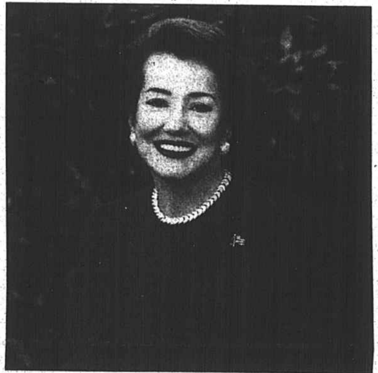
Sen. Elizabeth Dole