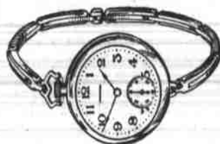
Waltham Convertible Wrist Watch 3/0 Size with patent disappearing eye in case 15 Jewel movement $30 7 Jewel movement $21.50