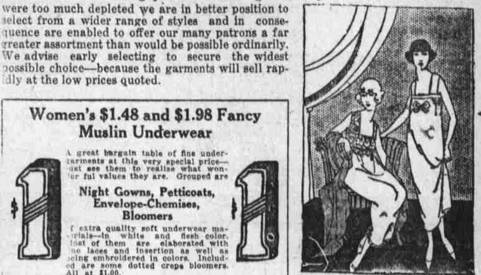
$2.50 Fink Crepe Gowns

The bodice is of silken material, hemstitched at neck and finished with narrow shoulder straps-bottom portion is of soft quality material and has deep hem. The ventiback style.......$2.48