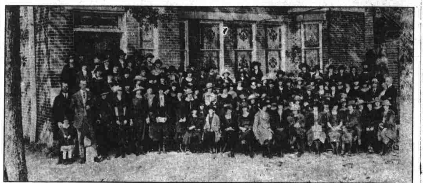
North Carolina College Girls, Members of Merritt Philathea Class of Forest Avenue Baptist Church

The extension of the already remarkable work for Baptist students at the North Carolina college by the Forest Avenue Baptist church took definite form yesterday when the congregation raised nearly $1,600 for a church hut to be erected immediately and to be finished by January 1, 1923.