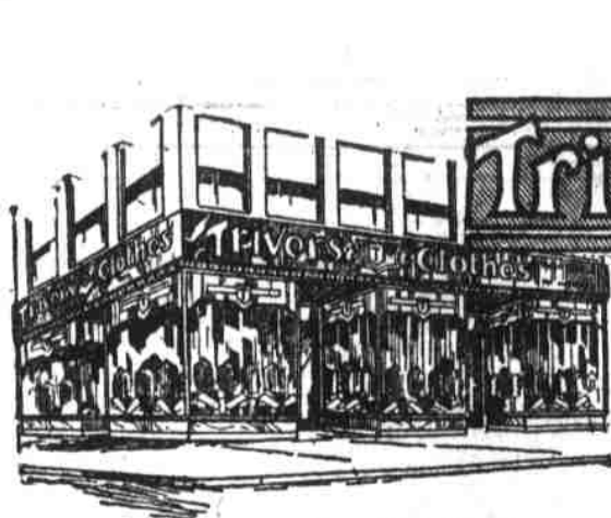
Our Downtown New York Store 801-7 Broadway, Corner 11th Street