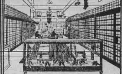
In the slack time of the day the Matson Store gets the figure facts on which to build for bigger profits.