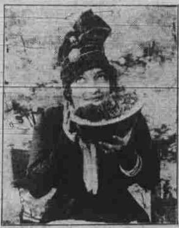
Anna Held who appears at the Grand tomorrow in "Madame La Presidente."

Whenever You Need a General Tonic Take Grove's The Old Standard Grove's Tasteless chill Tonic is equally valuable as a General Tonic because it contains the well known tonic properties of QUININE and IRON. It acts on the Liver, Drives out Malaria, Enriches the Blood and Builds up the Whole System. 50 cents.