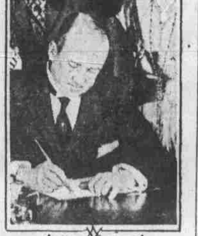
The suffrage cause scored another notable victory recently when Gov. R. Livingston Beekman affixed his signature to the bill which grants Rhode Island women the right to vote for president of the United States. Three leaders of the movement responsible for the success of the measure are shown standing behind the governor in the picture.