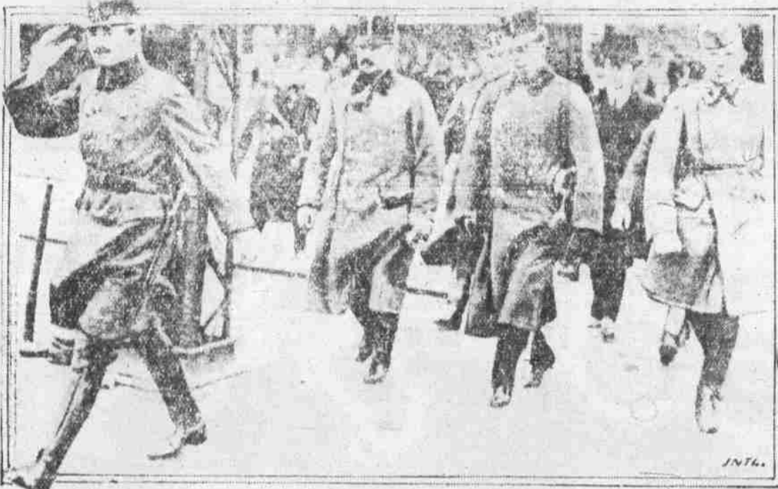
Ex-Empress Karl and members of his staff in the national park at Steinhilber, Hungary, while the former ruler of Hungary was walking to his train to return to exile in Sicily and after his vain attempt to regain the throne of Hungary. He stayed at Steinhilber several days, consulting with his advisers before he finally consented to return to Sicily.