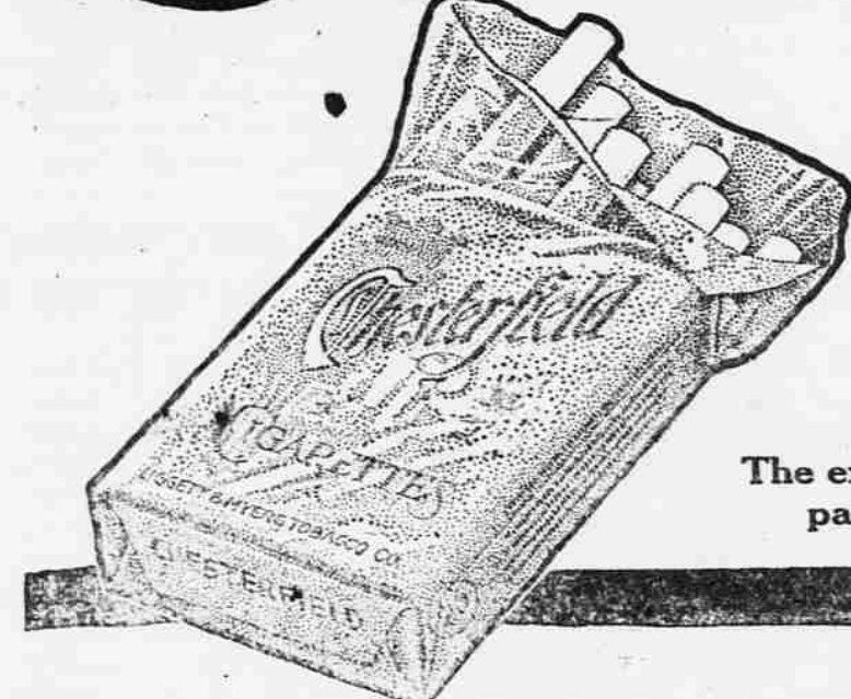
The extra wrapper of glassine paper keeps 'em Fresh

of IMPORTED and DOMESTIC tobaccos — Blended