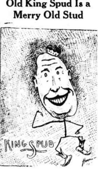
Old King Spud Is a Merry Old Stud COTTON is only a pretender to the throne in this corner of the South...