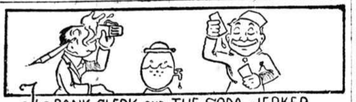
The BANK CLERK AND THE SODA JERKER ALL SALT WATER YARNS AREN'T SEA YARNS