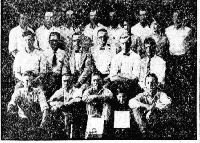
HERE is a group of Government men and their assistants who are helping to make the potato king in the Elizabeth City section...

EDENTON HAS ITS OWN JULY 5, CELEBRATION Two Fast Horse Races and League Baseball Game in Chowan Capital That Day