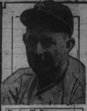
Charles W. Dressen , manager of the Cincinnati Reds.