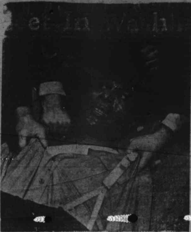
CLINTON ROSEMOND , veteran actor, whose performance in stages and in films for 17 years, the sensational new Deep South anti-lynching film, "They Won't Forget," produced by Warner Brothers, has skyrocketed him to stardom. He has appeared on the Director Mervyn LeRoy said after "They Won't Forget" was finished that he had never seen "a greater Negro actor."