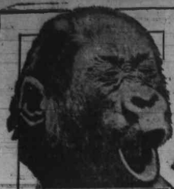
Do You Know When Do We Eat? This gorilla from one of New York City's zoos finds life terribly boring. Study this picture closely and you will undoubtedly start yawning too.