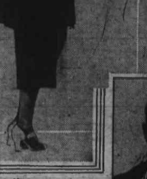
THE WOOLEN SUIT —This woolen suit worn by Arline Judge, screen star, has a short skirt with a cluster of kick-pleats in front; a brief jacket of blue and white Shepherd's plaid with a white scarf tucked into the neckline. There are silts in the cape for the arms to go through.