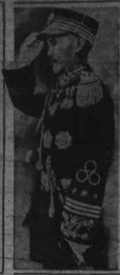
HEAD OF CHINESE ARMY —Generalissimo Chiang Kai-Shek, Commander in Chief of the Army, who was abducted in what promises to be a fierce civil war.