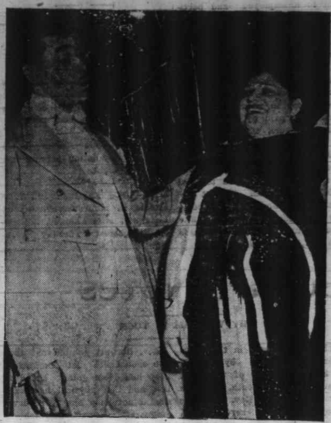
PHOTO shows the famous Cabell Calloway III, introducing his first soloist, the noted June Richmond, who formerly warbled for a white band before signing up with Cab's hot Cotton Club Orchestra, now in its third winter on the Great White Way, Broadway, and 48th St., New York. Cab is also busy rounding out courses for his new "Live University," which will be broadcast over CBS from the Cotton Club.