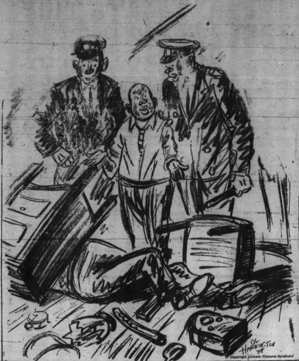
"BUT OFFICER, WE WUZ ONLY PLAYIN' FRIENDLY LIKE!"

DAUGHTER LAUGHTER ..... BY OL HARRINGTON