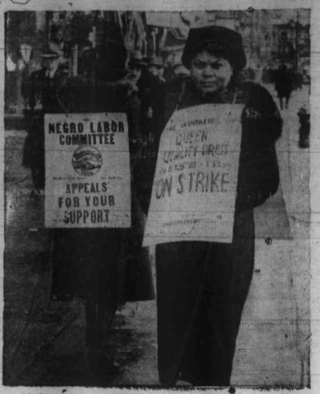
WINS BETTER WORKING CONDITIONS