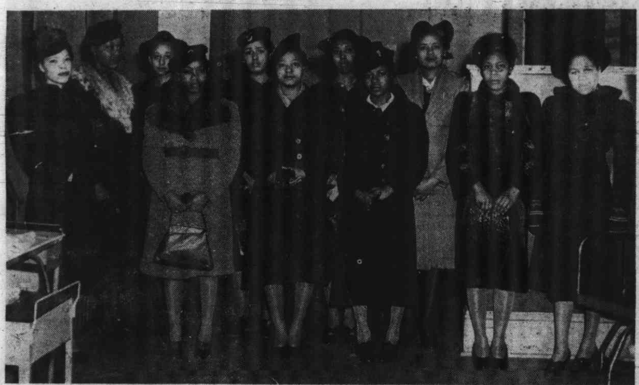
PERSONS taking the examina- | demonstrate on living models so | ion. The above group is composed | took the January examination ton to practice the art of there will be no doubt as to of models for the DeShazor last Friday, beauty culture are required to their knowledge of the profess. Beauty College graduates who —Phot