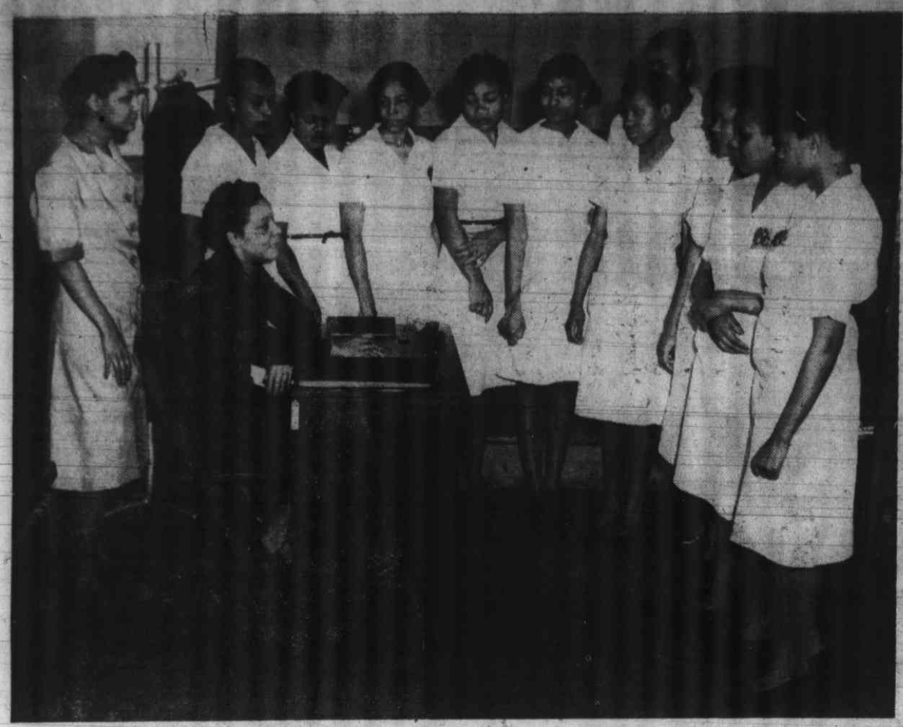
ALTHOUGH THIS PHOTO above group bearded a special the art of beauty culture none Jackson is seen giving the last was taken just a few minutes bus for Raleigh to take the ex- in the picture appear the least word of encouragement to the before the young ladies in the amination for license to practice bit disturbed. Mrs. Deshazor candidates.