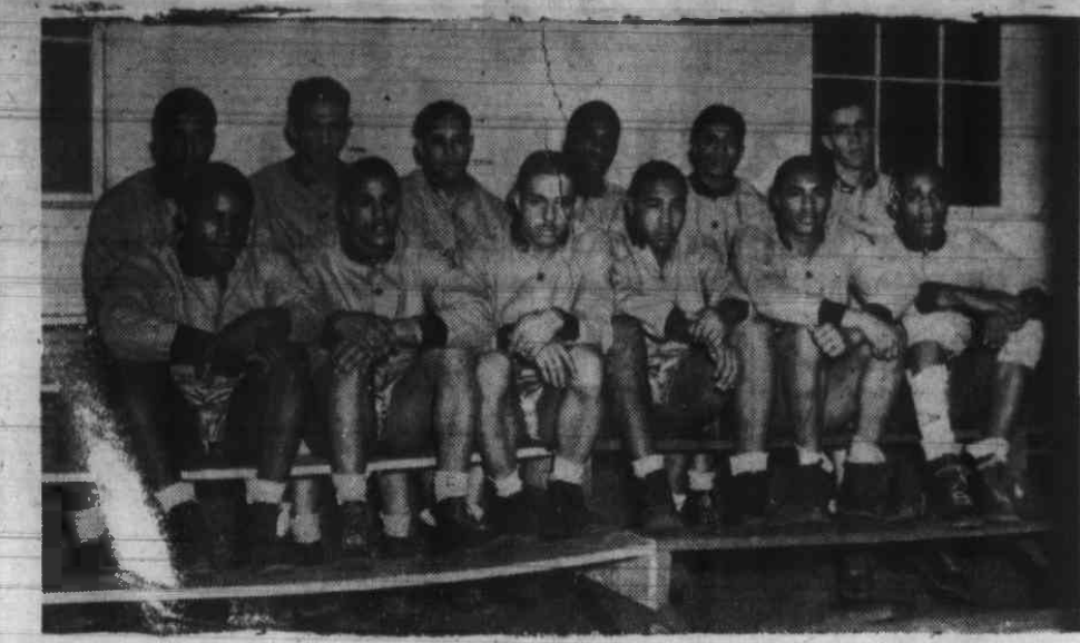
EAGLES MAY BE ROBBED OF CIAA TITLE

Raleigh, Charlotte, Greensboro, Durham, Rocky Mount, Wilson, Burgaw and many other nearby towns have been contacted.