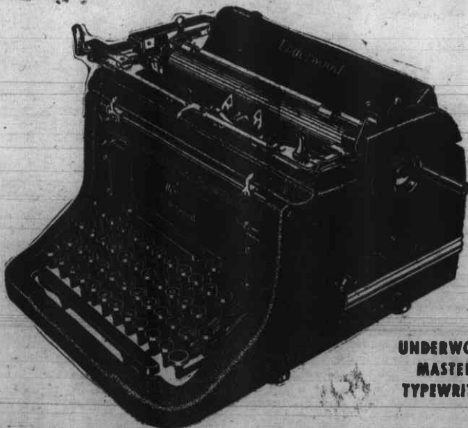
UNDERWOOD MASTER TYPEWRITER

MADE BY THE TYPEWRITER LEADER OF THE WORLD