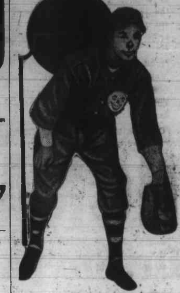
OF ETHIOPIAN CLOWNS

The track meet is sponsored, by the Virginia High School Ath-