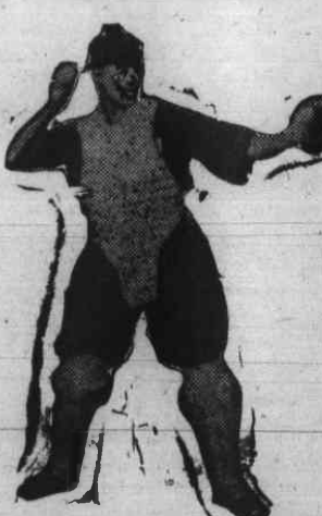
C. of ETHIOPIAN CLOWNS

ASIA CAFE Chinese-American Food Sanitary-Grade "A" Speciality. -S t e a k Chicken Chops and Dishes of all kins MM Chinese dishes of all kinds Sandwiches Courteous Service at all ASIA CAFE