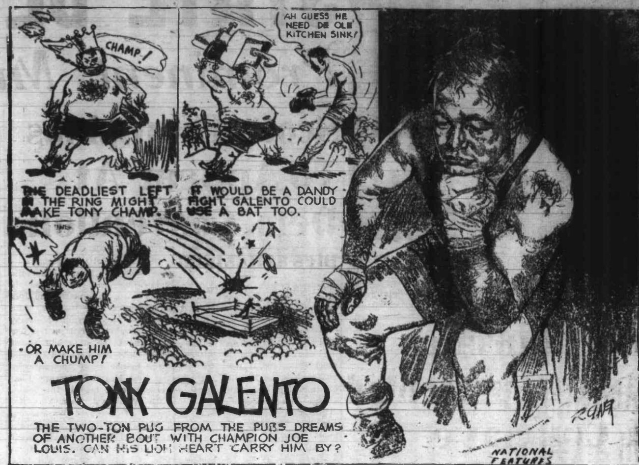
TONY GALENTO THE TWO-TON PUG FROM THE PUG'S DREAMS OF ANOTHER BOUT WITH CHAMPION JOE LOUIS. CAN HIS LION HEART CARRY HIM BY?