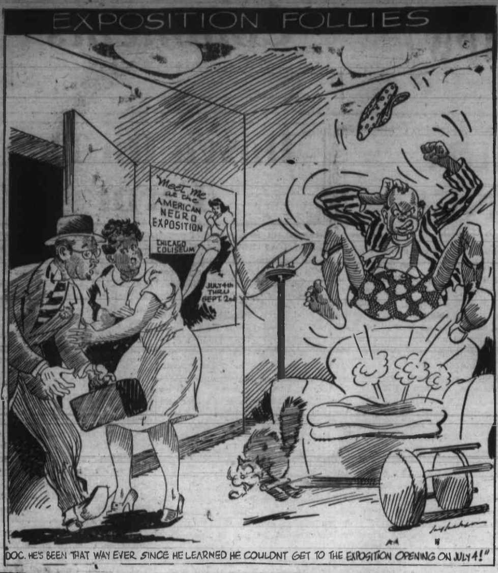
DOC. HE'S BEEN THAT WAY EVER SINCE HE LEARNED HE COULDN'T GET TO THE EXPOSITION OPENING ON JULY 1st!