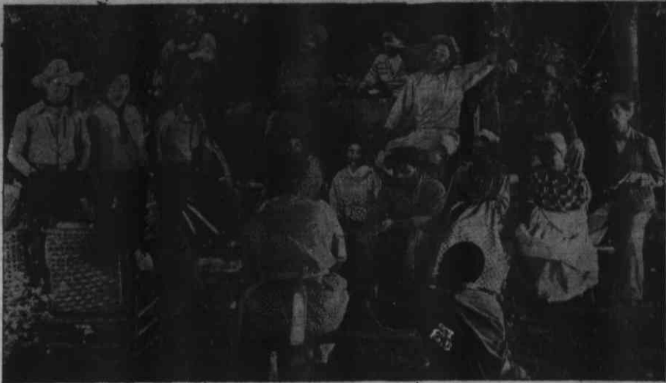
The Scott Crinoline Choir adds to the enjoyment of Republic's latest Gene Autry film, "Carolina Moon." Here they are in a scene from that picture with Gene Autry and Smiley Burnette.