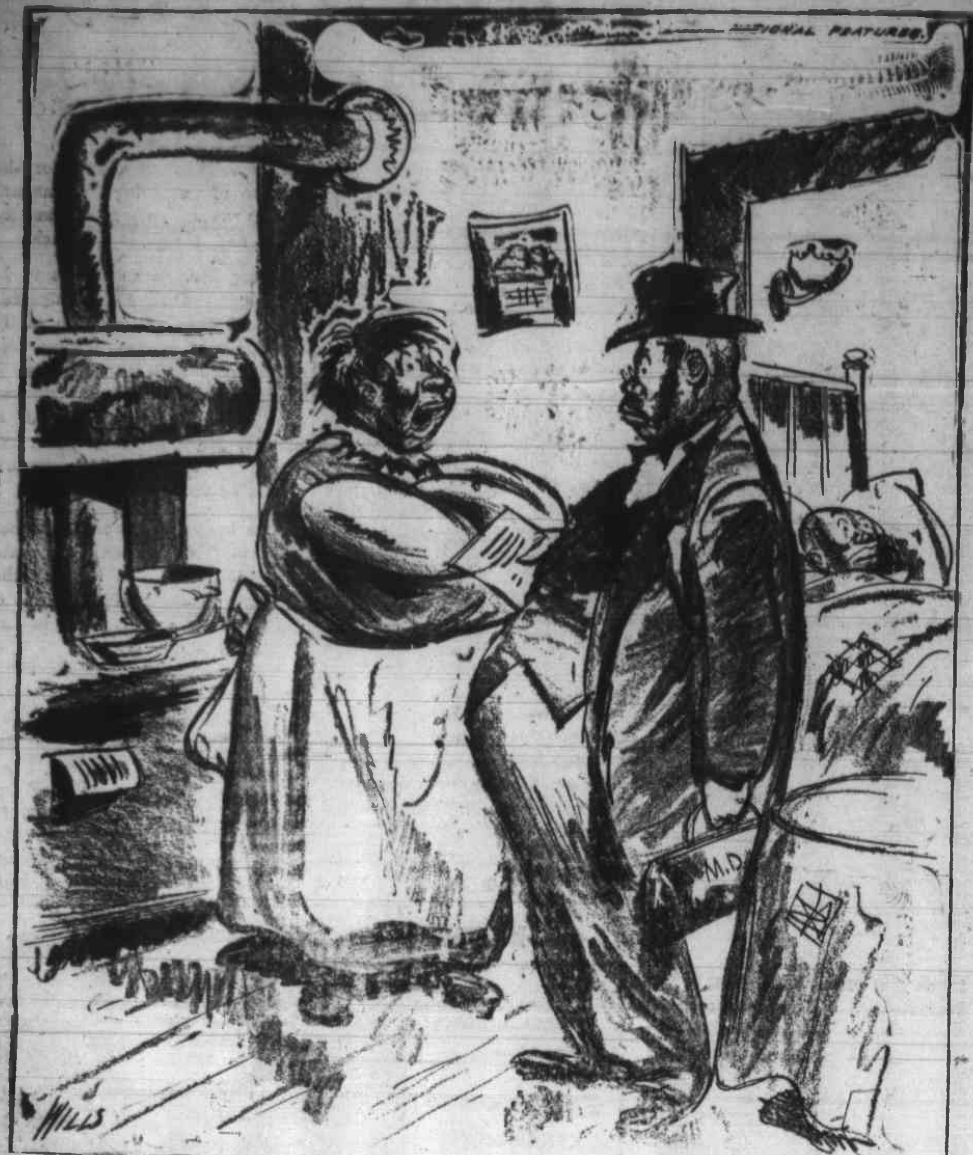
"Oh sure Docah-Cousin Eulace, will take the take the medicine, specially if it got foam on it. He likes any kind o' medicinewith foam on it!"