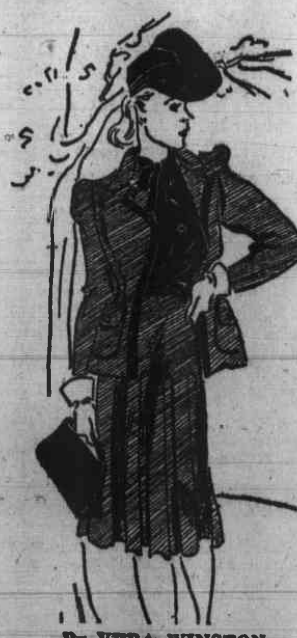
By VERA WINSTON

A SARTORIAL find is the dress A SARTORIAL find is the dress or suit that one can live in, a garment that never loses its original freshness or appeal and which looks attractive all through the day. Here's such a find, a suit of dull chalky brown woolen with a dark brown velvet blouse. A strip of velvet anlivens the jacket front. The band collar of the blouse ties in a bow at front and shows above the high revers of the jacket, which is fitted through the waist and has two patch pockets. Velvet buttons and button-holes are on the velvet band down the