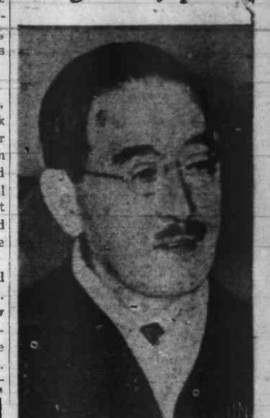
Japanese ambassador to Germany, Saburo Kurusu, signed the tripartite consulative pact linking Germany, Italy and Japan, for his government, in Berlin. The pact pledges the parties to stand together against any outside opposition to programs for a "New Asia" and a "New Europe."