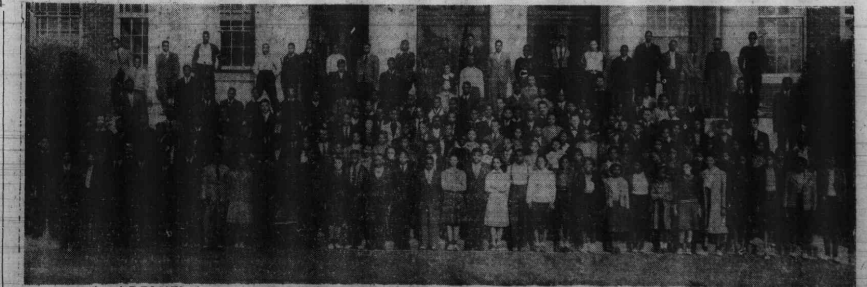
A and T BOASTS of a freshman class enrollment of 364 students, it was announced last week. Some of the freshmen are shown above as they stand on the steps of Dudley Administration building, North Carolina registered. Virginia is second, New York is third, and New Jersey, fourth.