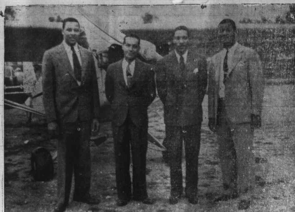
Readying the stage for the introduction of secondary flight instruction at Lincoln University, Jefferson City, Mo., these four members of the Lincoln staff look toward

increased attendance and personnel in the aviation courses being planned for next semester. Ten students have just completed the primary flight training course under Erskine