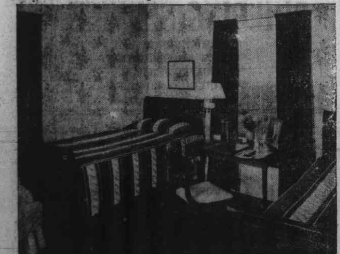
A table desk is arranged between two beds

As most rooms have two windows the chances are another window will come at the foot of one of the beds and a door to the hall on the opposite wall while the closet door is on the end wall to one side of the bureau. So much for the arrangement.