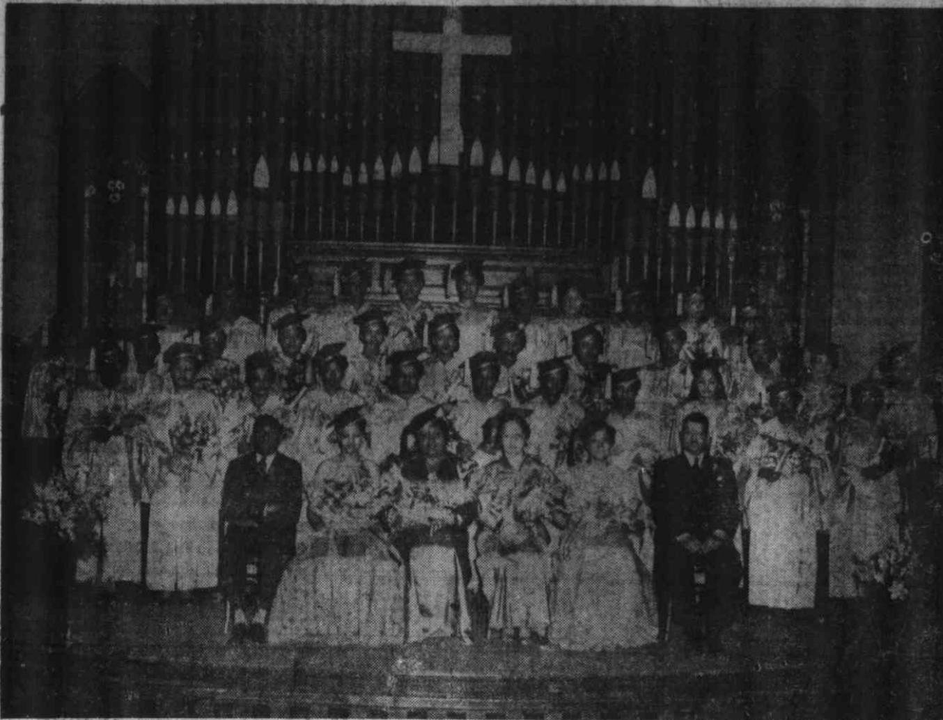
Last year's class held its graduating exercises at the St. Joseph A. M. E. Church located on Fayetteville street in this city. This was one of the largest groups to finish the college since its beginning in 1937. Seated in front of the graduates are several members of the faculty.