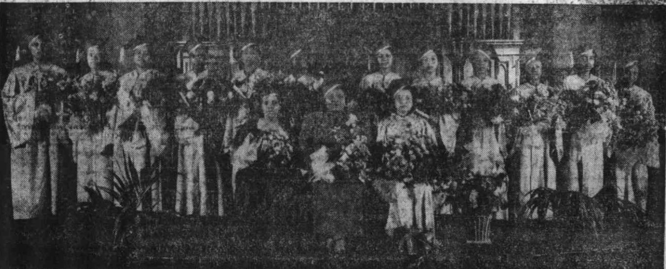
The picture above shows the first graduating class to complete the course in Beauty Culture offered by the DeShazor Beauty College. All of the members of the class are now gainfully employed in the practice of their profession in various sections of this and other states.