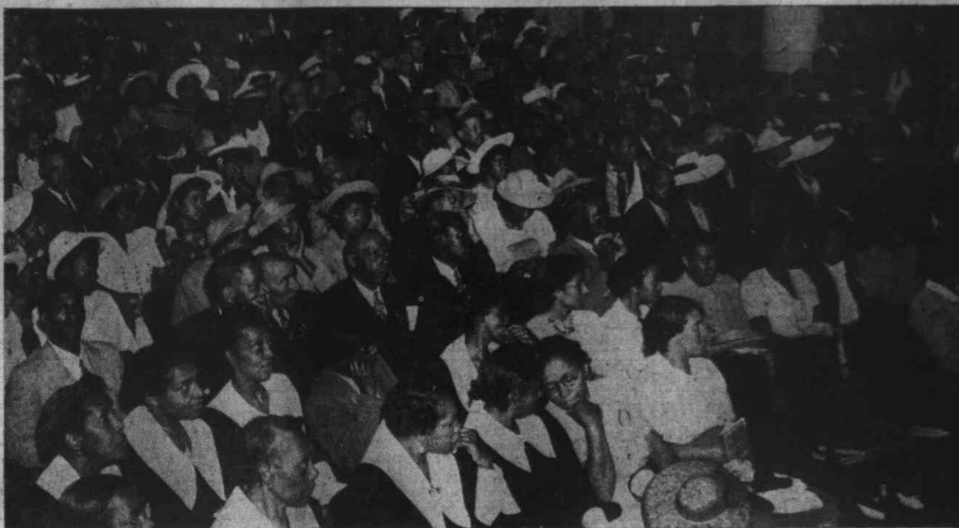
Approximately 2,000 persons were in attendance at the 42nd Annual Singing convention held at the Pearson School here last week by the New Hope Baptist Association. Shown above is a section of the vast throng that jammed the auditorium and overflowed into the corridors and grounds of the school.

Washington high here, for equal pay to white and colored teacher who are equally qualified.