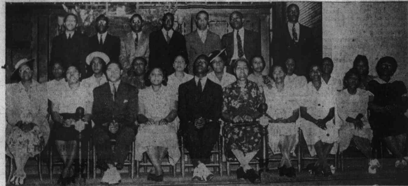
SUNDAY SCHOOL OFFICERS:—The above photo is that of the officers and teachers of Mt. Vernon Sunday School, which is one of the largest in the city. Spacious rooms for Sunday School classes have been provided for, in the basement of the new church.