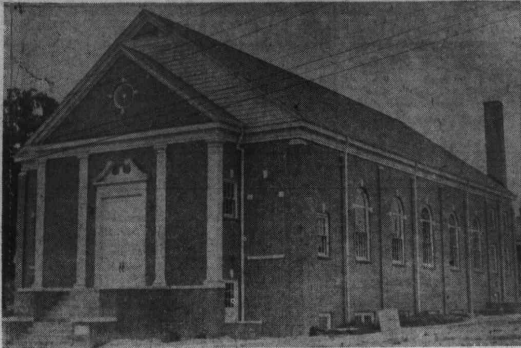
The new Mt. Vernon Baptist Church was erected at a cost of approximately $50,000. It is the most modern church in Durham. The main auditorium is said by many to be the most beautiful of any colored church in Durham. The basement floor is taken up by Sunday School rooms, kitchen and a Sunday School auditorium.