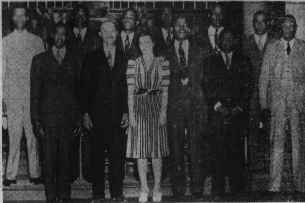
In the picture above are the officers of the church and the pastor. These men and women have worked arduously with the pastor to give the community its finest church structure.