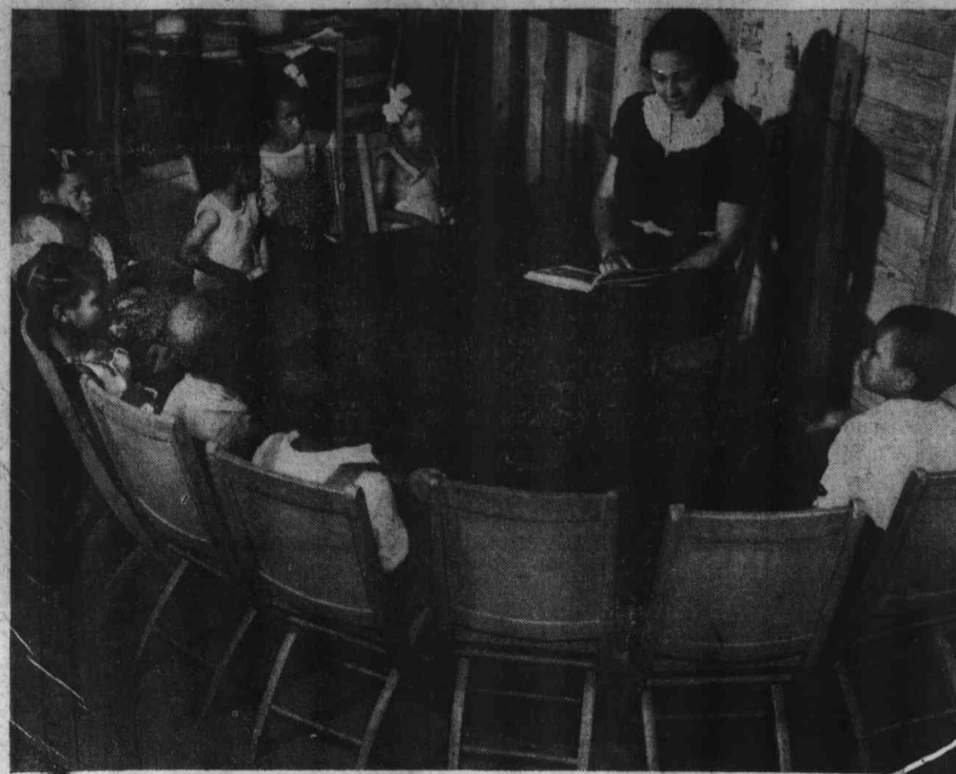
Pictured is a scene of one of the WPA operated nursery in the city of Charlotte. These tiny pre-school children are under the supervision of a trained worker, who guides them through the day until mother comes home from work. In addition to developing the hidden interest of the children, the nursery provides a wholesome environment for the kiddies, and encourages the formation of good habits.