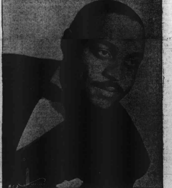
BENNY CARTER Benny Carter, America's leading tenor-sax exponent, who is currently "on tour" with petite Maxine Sullivan, "the Loch Lomond" girl.